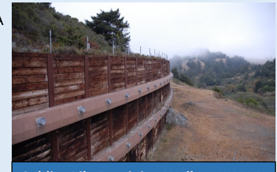
Soldier Pile Retaining Wall on HWY 1